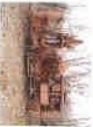
Model C Serial # 359